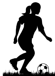
VERY IMPORTANT PLAYER

A “special needs only” league that offers an alternative for young people choosing to enjoy a shorter game, modified rules and field size, and assistance of a helpful “buddy” on the field as needed. Anyone in Tucson, 4 1/2 or older, regardless of disability type is welcome to register. The program is designed for players that cannot succeed on a typical soccer team. The VIP League’s parents de-